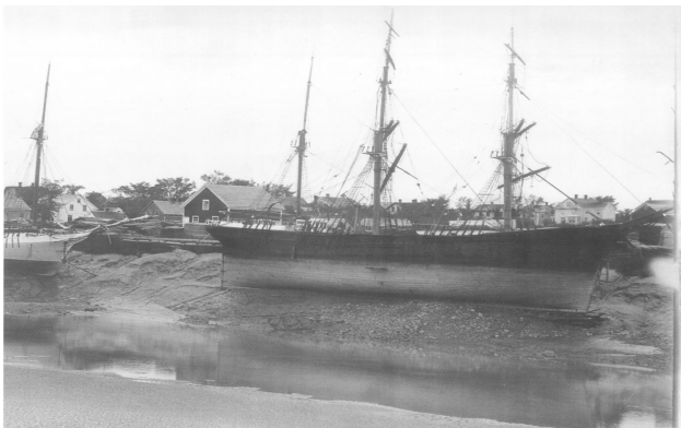
Calburga, docked at Port Williams ca. 1895