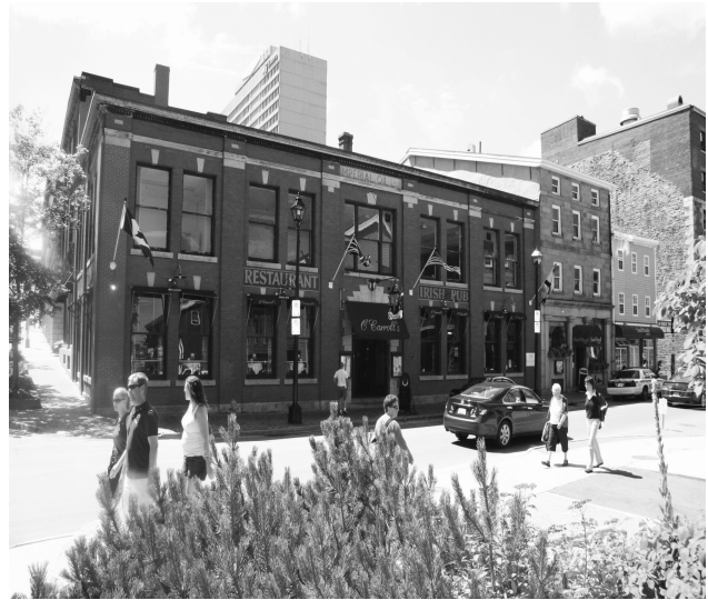
Imperial Oil Building

• The Imperial Oil Building at 1860 Upper Water Street. This classical-style building is constructed in brick with granite details, such as keystones over the windows, and capitals above the array of decorative brick pilasters, which give vertical definition to the overall sectioned style. Built as offices for Imperial Oil Ltd., the building continued in that role for thirty years and then housed various shipping firms and consulates. Currently, the building is the character-infused setting for O’Carroll’s Pub and restaurant. The developer has applied to completely demolish the Imperial Oil Building, registered in 1985. A replicated façade would be applied to the bottom corner of the modern structure.