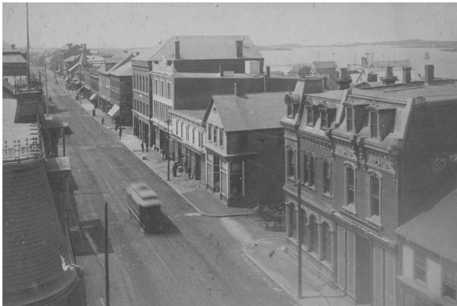
Yarmouth in 1893

Probate records include wills and estate papers, the latter are extremely useful to built heritage researchers because they include the executors' inventories of the deceased's house and