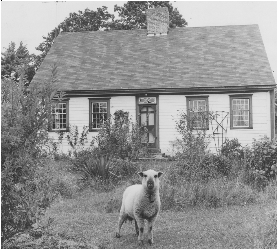
Medway Inn, a Cape Cod style house, Mill Village, Queens County