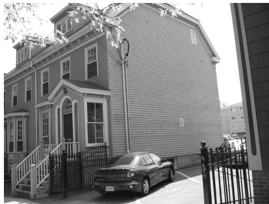
1488 Carleton Street Continued on page 10