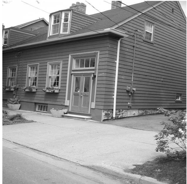
1329 Birmingham Street