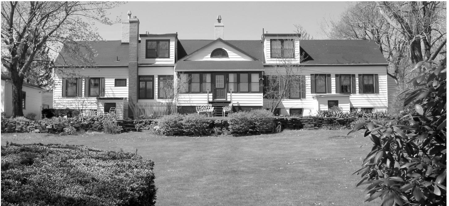
The Commanding Officer's Residence, Royal Artillery Park, Halifax is the oldest military residence of its kind in Canada.