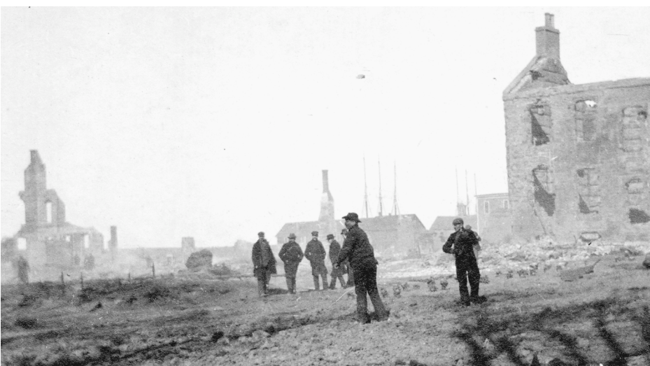
The remains of Mounce's Hotel, Windsor.