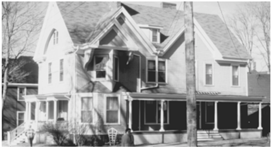
John C. Keith Residence, Clifton Street, 1898. This 2.5 storey home was 60x34 feet, with a back ell for cold storage 20x14 feet, a conservatory at the rear of the house, 24x24 feet. The interior was finished in Cyprus (sic), quartered oak and white wood. This house was also designed in the shingle or Stick style. At the same time a large barn, 42x24 feet containing stables, coach house, wood and root storage was built.