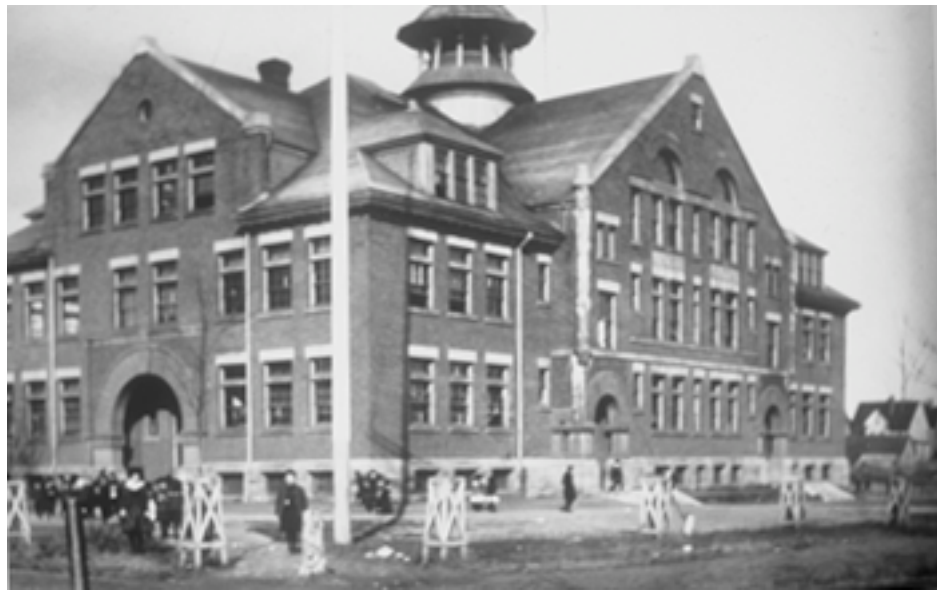
Courthouse, Windsor, N.S. Located on Windsor and Victoria Streets, destroyed by fire in 1947.