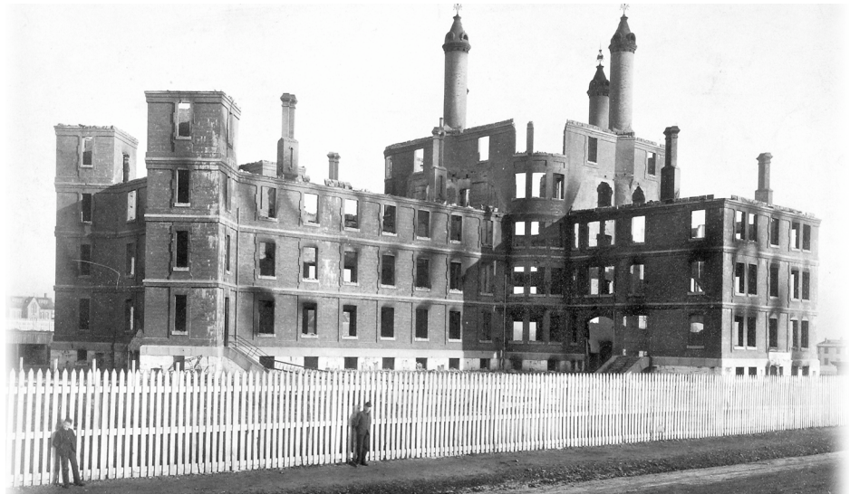
Above, the remains of the Poor House after the 1882 fire which killed 31 residents. Below, horse-drawn fire engines ready for action at Halifax's Centre Fire Station.

Many fires began in the central fireplaces of homes, resulting in a notice that unless such chimney had been swept by a licensed sweeper within one month of the date of the fire, the owners would be prosecuted. Fire wardens were appointed with the authority to supervise the fire fighting as well as safety precautions at the site. The necessary equipment, in addition to the buckets, canvas salvage bags, and ladders included axes, saws, chains, grappling hooks and bed keys: the key was needed to dismantle a bed, perhaps the most important furnishing in a home. The military might help by blowing up a building to block the path of a fire. A newspaper story noted that in Halifax "fire and destruction were as possible as catching a cold".