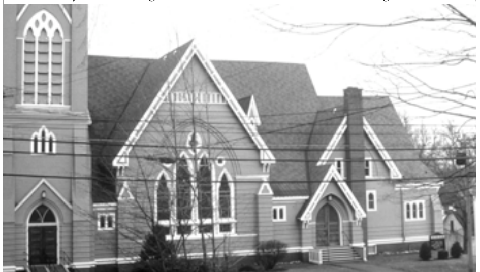
Saint John's Presbyterian Church and School House, King Street, now Windsor United Church.