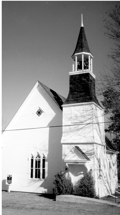
Above Torbrook Mines United Church, 1889. Below, St. Andrew's Presbyterian Church.

The church is also distinctive because of its bell tower and spire which has a solid square base rising through a mansard roof-style section to an open bell space topped by an elegant length of hexagonal spire. As was often the case in rural churches, there are touches of Greek Revival style, notably broken pediment brackets on the gable roof ends and the porch-like covering which projects over the front entrance giving a sense of dignity and