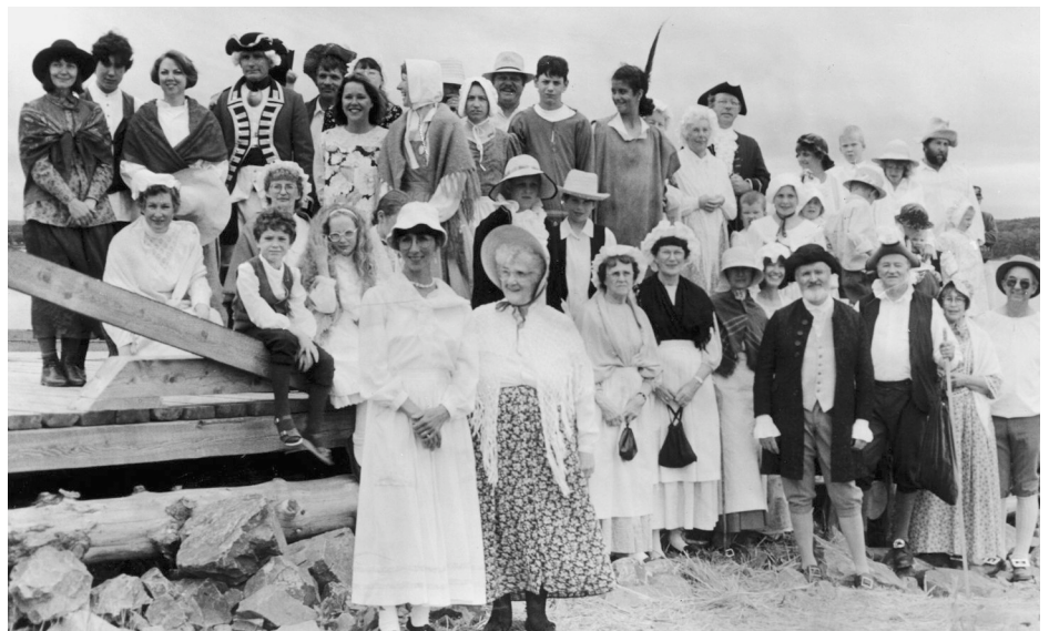
About 50 local residents in Planter dress participated in the first re-enactment of the arrival of the Lydia and the Sally at Newport Landing."