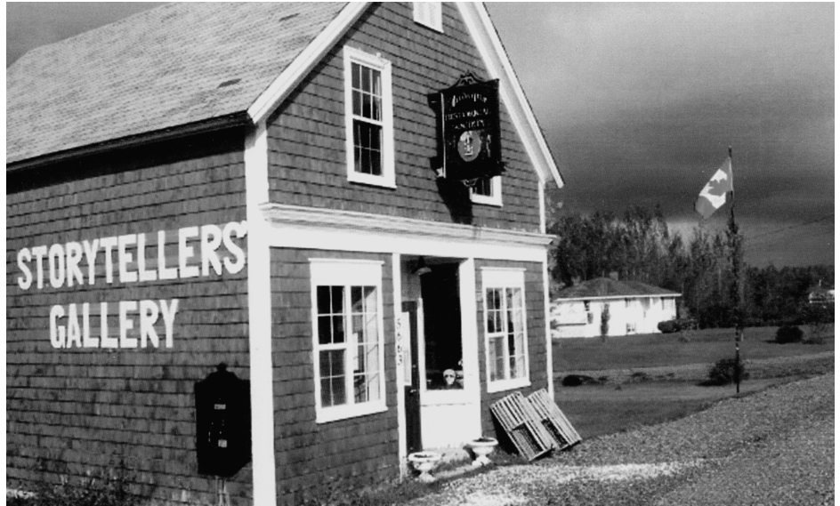
Above, the Storytellers' Gallery and lower left, The Old House Antique Shop.

The Judique Historical Society's "Storytellers' Gallery" in Inverness County is the amazing revitalization of an old miner's company house from Port Hood, north of Judique, which was moved after the closing of the mines to Judique where it became a store. Since then, it has been imaginatively transformed into a museum telling the stories of