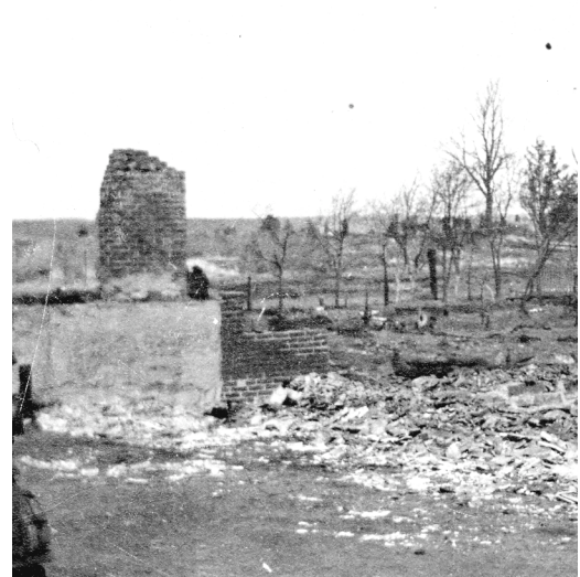
View of devastated Windsor.