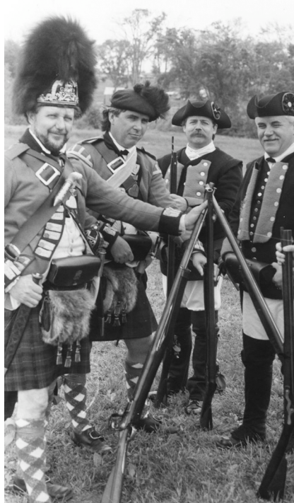
The first re-enactment of the landing in July 1994 also included 'Members of Gorham's Rangers and the 84th Regiment of Foot'.

Since that time, the community has built, and continues to operate, the Avon River Heritage Museum. A wooden sailing ship, the Avon Spirit , was built in the Avon Spirit Shipyard adjacent to the museum (see The Griffin , September 2004). In 1998 the Avon River Heritage Society and the Avon Spirit Co-op were named the "Best New CED Project" as part of the Nova Scotia Community Economic Development Awards Program.