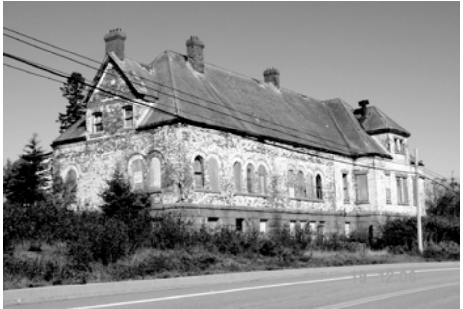
Above, the Commercial Cable Company, main cable office, November, 2004. Below the main cable office circa 1900.

The third competitor, Commercial Cable Company, was founded in 1883 by John William MacKay, an American financier, who joined forces with James Gordon Bennett, the aggressive publisher and proprietor of the New York Herald , a newspaper